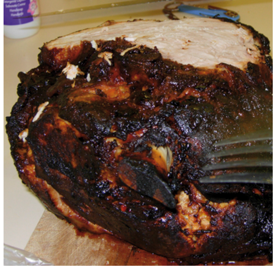
->end of a festival day: the common diner