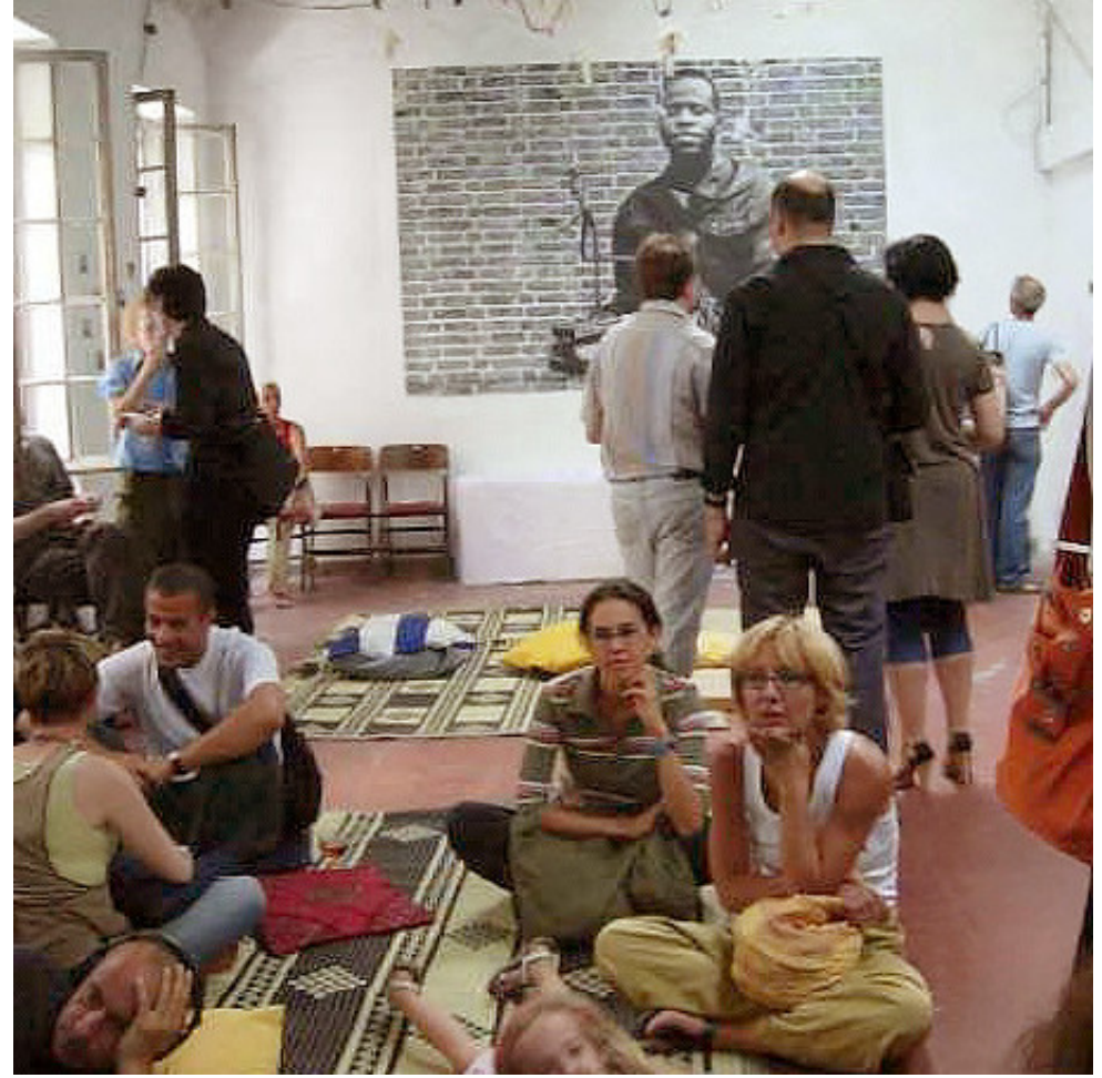
-> festival audience